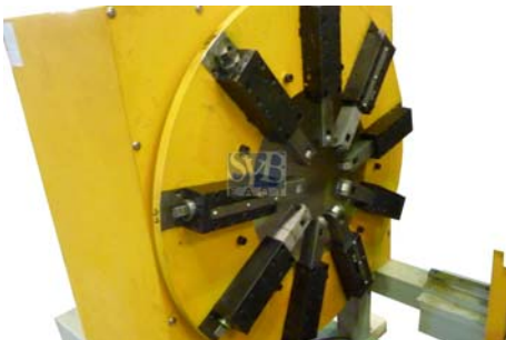
Clamp for PVC Pipe

Machine can be setup with different thread pitches. The thread ratios are easily entered through CNC screen. No gears, chains or lead screws to adjust. It is all electronically linked from spindle to actuator. Changing between pipe sizes is much simpler on this machine. First change pipe holding clamps and thread cutter if going from ID to OD. From there you will select the appropriate program stored in CNC System.