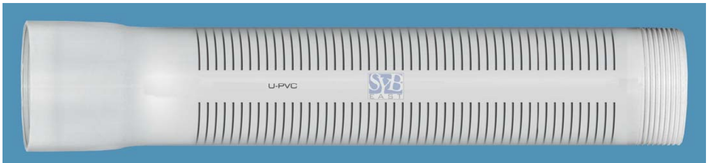
PVC Slotted & Threaded pipes as per DIN 4925