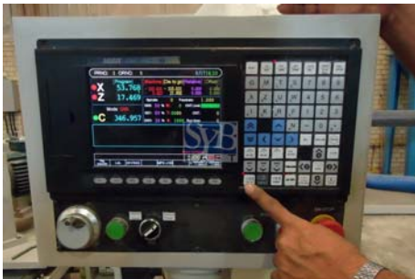
Human Machine Interface

Our threading machines are equipped with special CNC Control, Delta Brand, Taiwan. Both X-Axis and Y-Axis movements are controlled by servo system. The sophisticated CNC control enable machine to produce any type of threads.