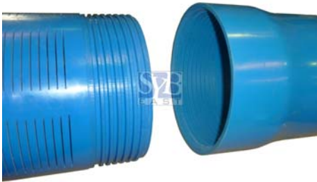
PVC Slotted pipes for underground water well as per DIN 4925