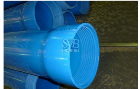
Internal Threads DIN 4925