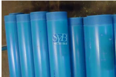
HDPE, PP, PVC & Plastics Threads