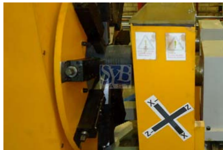
Threading on PVC Slotted pipe