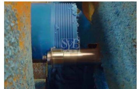
HDPE, PP & PVC Pipe Threading

This machine has proven to be extremely dependable and trouble free. This system can be compared to a scaled down version of a CNC lathe but with more simplicity and ease of operation.